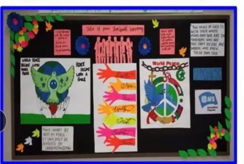
Winner The Sagar School, Alwar